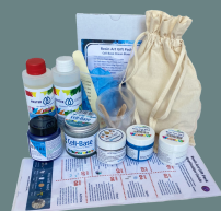
Resin Art Gift Pack