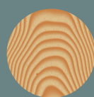
Art Board / Canvas