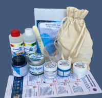
Resin Art Gift Pack