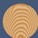
Art Board / Canvas