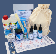
Resin Art Gift Pack